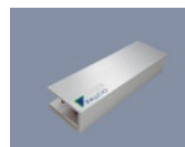
U-545- Mounting bracket for glass door- U Channel