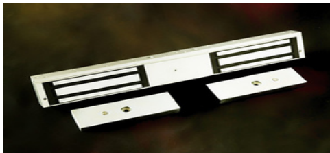
ASC-1200iD - 1200Lbs Double EM locks w/LED, 12/24V, Nickel Plated